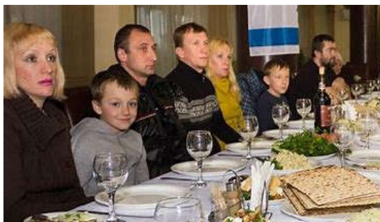
Before immigrating, Ukrainian Jews have Passover meal.