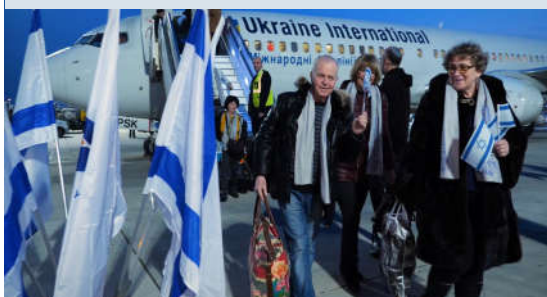
Ukrainian Jews return to Israel after thousands of years in exile.